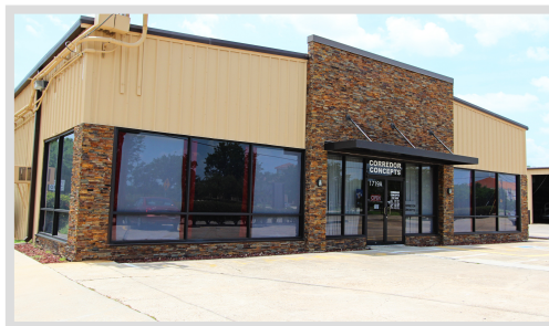
Recently remodeled exterior